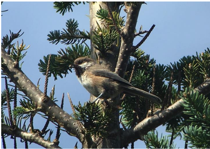
Boreal Chickadee, ©Barry Zimmer

Not all our time will be spent at sea, for there is plenty to do on Grand Manan itself. The spruce forests here should harbor numbers of migrant passerines, particularly warblers. At favored spots, such as Long Eddy Point, it's not uncommon to encounter flocks containing Black-capped Chickadee, Red-breasted Nuthatch, both kinglets, a couple of vireos, a few flycatchers, and a half dozen or more species of warblers. If we are lucky enough to be visiting during a good finch year,