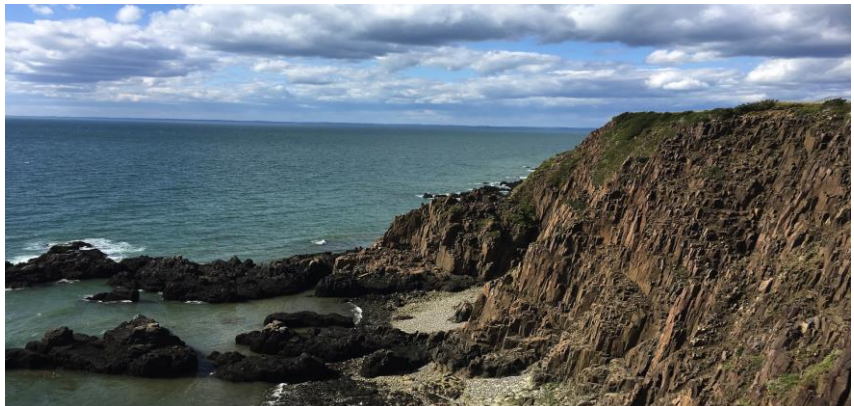
Southwest Head, Grand Manan, New Brunswick

September 2, Day 2: Bangor to Grand Manan. Today we will drive to Blacks Harbour, New Brunswick, to catch our ferry for the ninety-minute ride to Grand Manan. We will likely do some roadside birding en route, but our main goal is to make sure we connect with the ferry. The ferry crossing frequently produces at least a few pelagic birds including small flocks of phalaropes, or lone jaegers, gannets, and shearwaters.