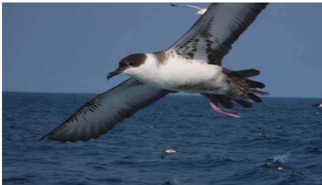
Great Shearwater

September 3,4,5, Days 3, 4, 5: Grand Manan and Pelagic Trip. These three days will be spent exploring the Bay of Fundy and the island of Grand Manan. Our exact schedule will remain flexible, allowing us to take best advantage of the tides and weather. One full day will be devoted to a boat trip into the Bay of Fundy in search of pelagic birds and marine mammals. Grand Manan is situated in close proximity to a number of prominent submarine canyons and shelves. As the currents meet these underwater barriers, great upwellings are created which propel the colder, nutrient-rich bottom waters to the surface. This, in turn, concentrates plankton, fish, and ultimately, large numbers of pelagic birds and whales.